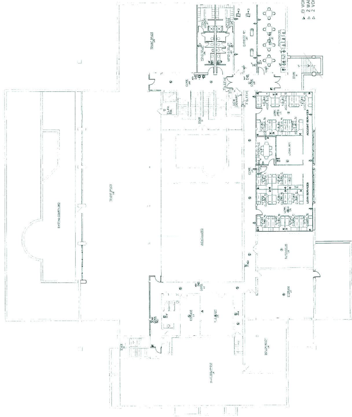
LOWER LEVEL FURNITURE + FLOOR PATTERN PLAN