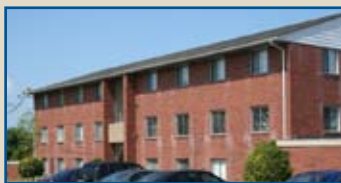
Phase II Three 3-Story Buildings