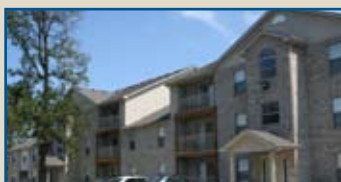
Phase IV One 3-Story Building