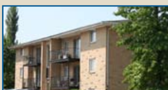
Phase III Three 3-Story Buildings