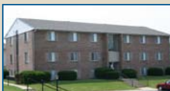
Phase I Three 3-Story Buildings